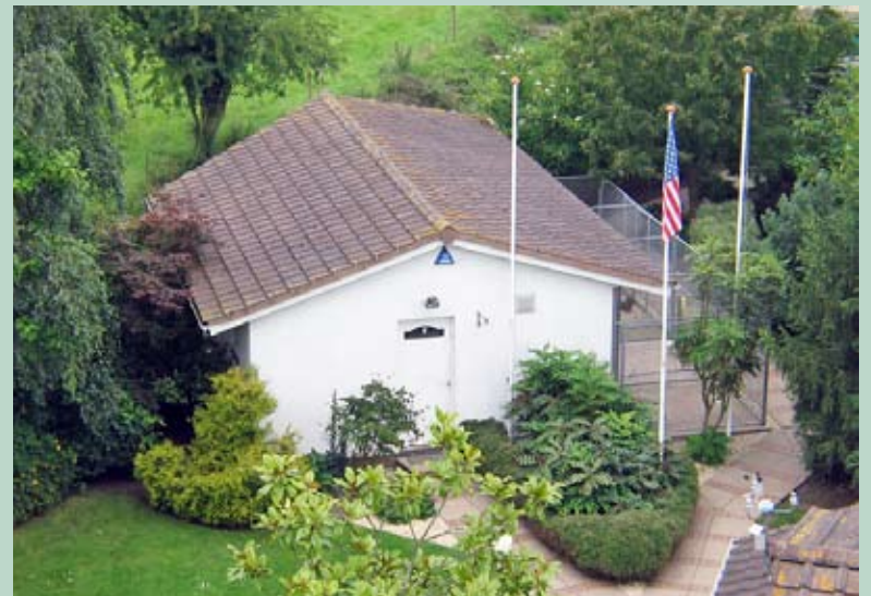
LUCIES FARM LUXURY DOG RESORT