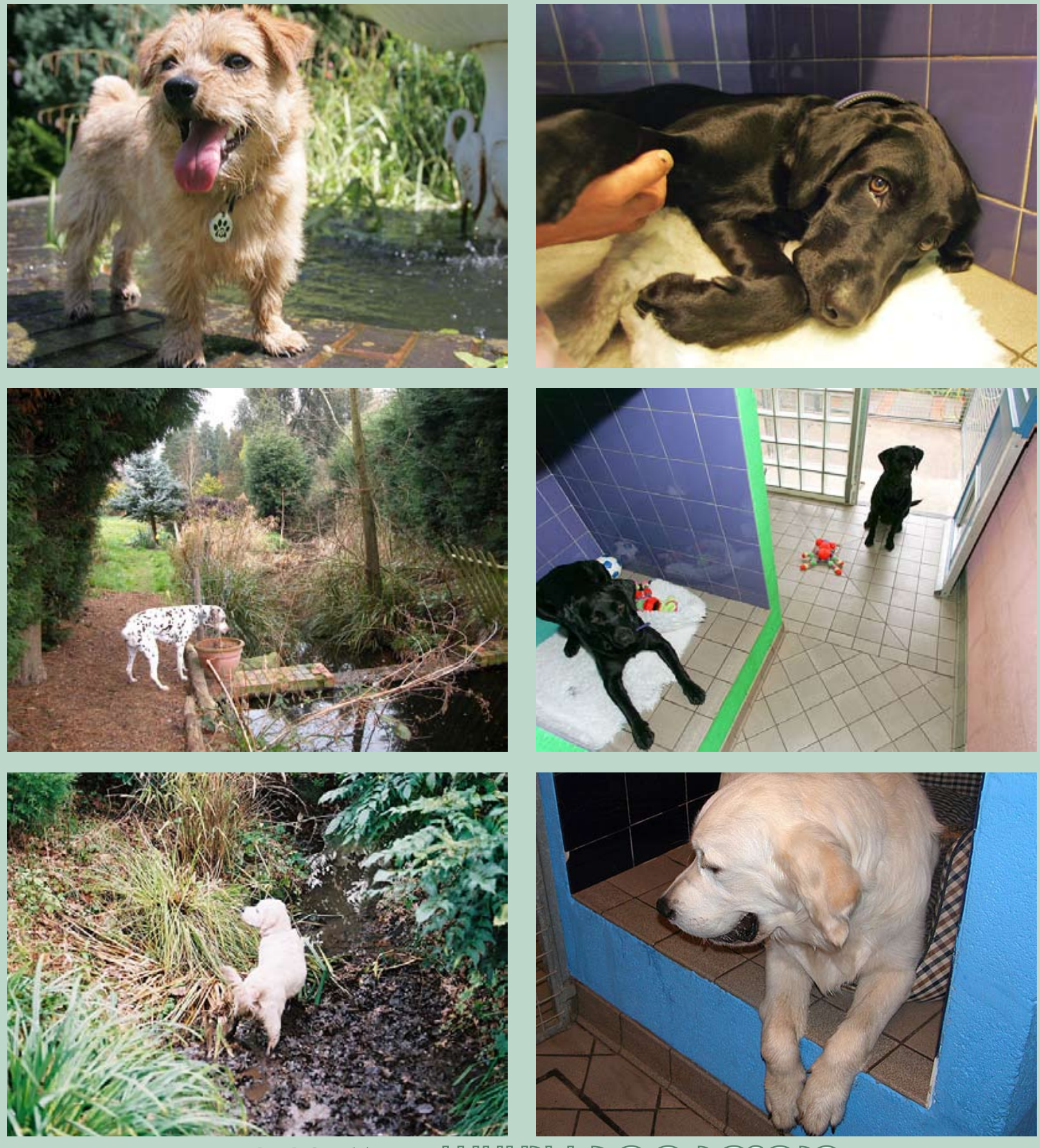
LUCIES FARM LUXURY DOG RESORT